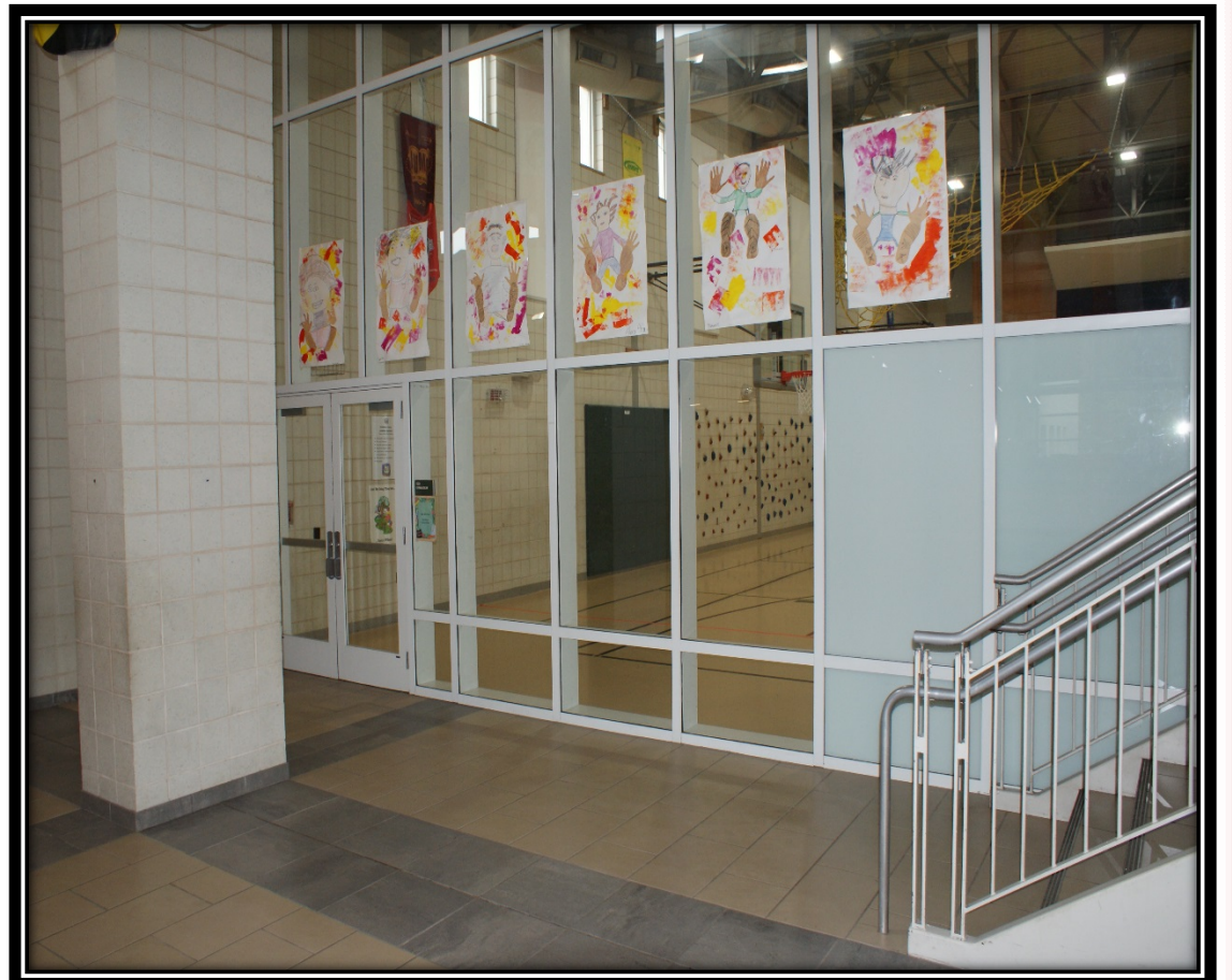
Districtwide Security Infrastructure