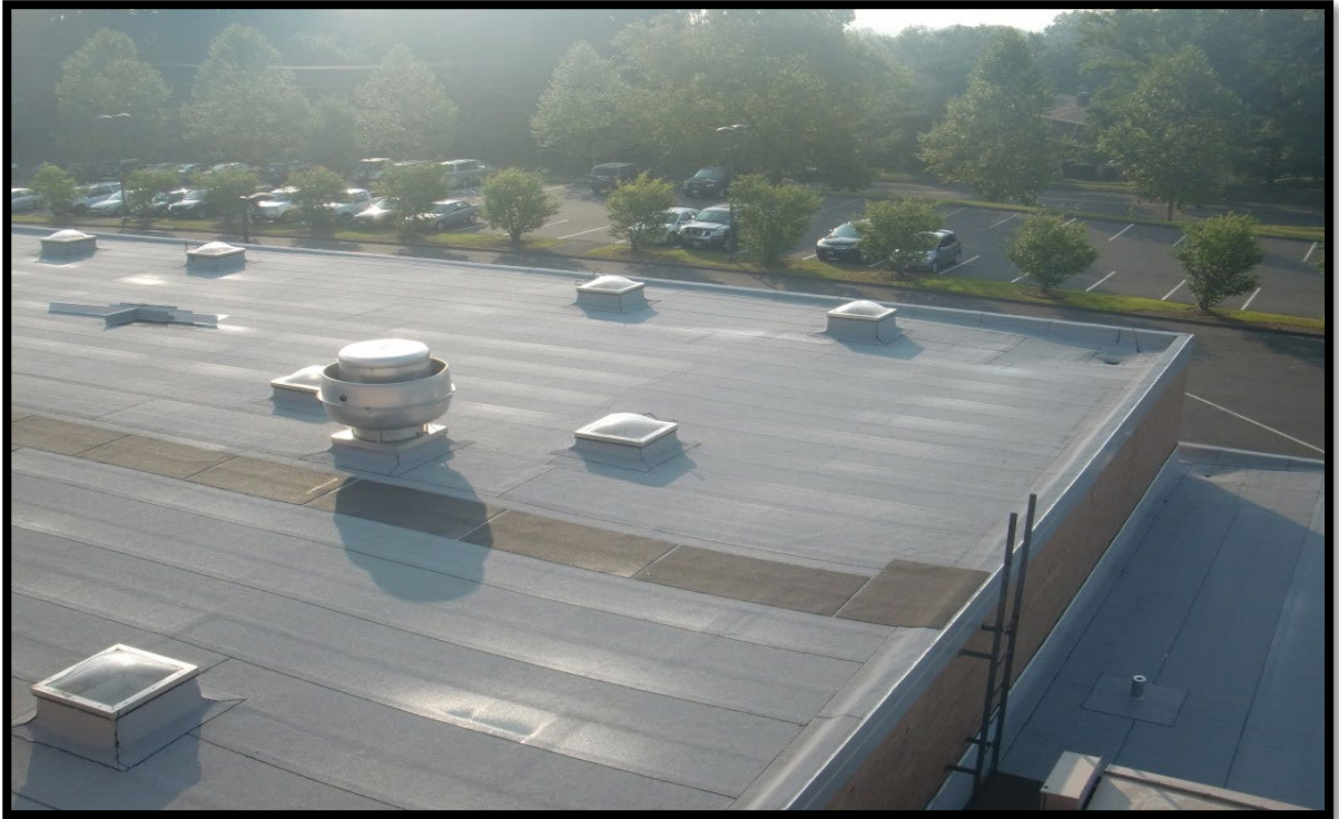
New Roof Conditions