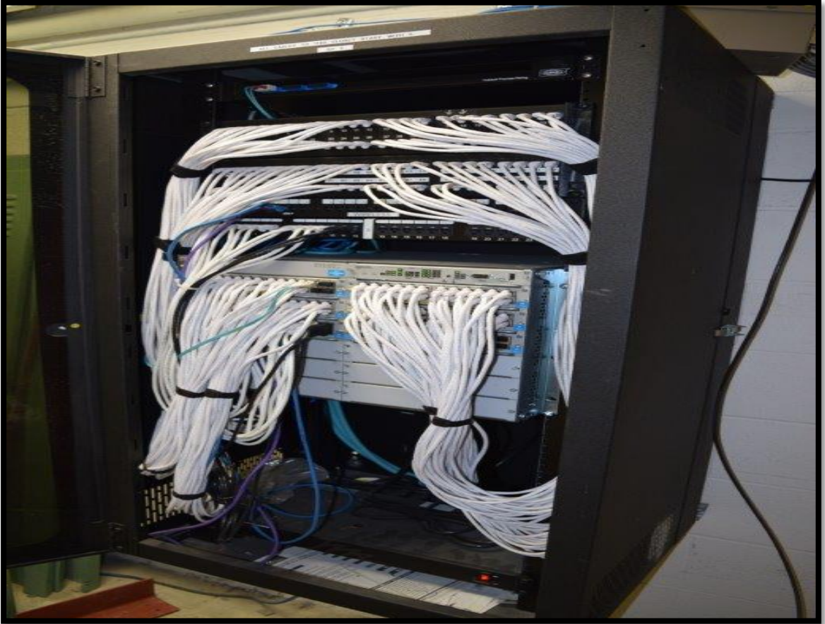
End of Life Switch Conditions