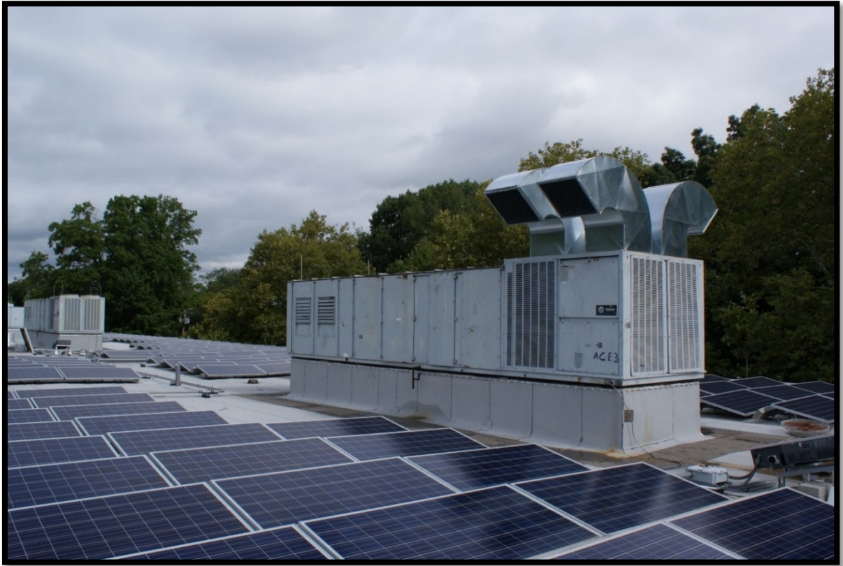
Existing HVAC Rooftop System