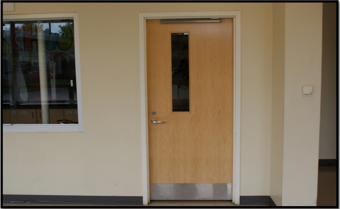
Existing Interior Classroom Door