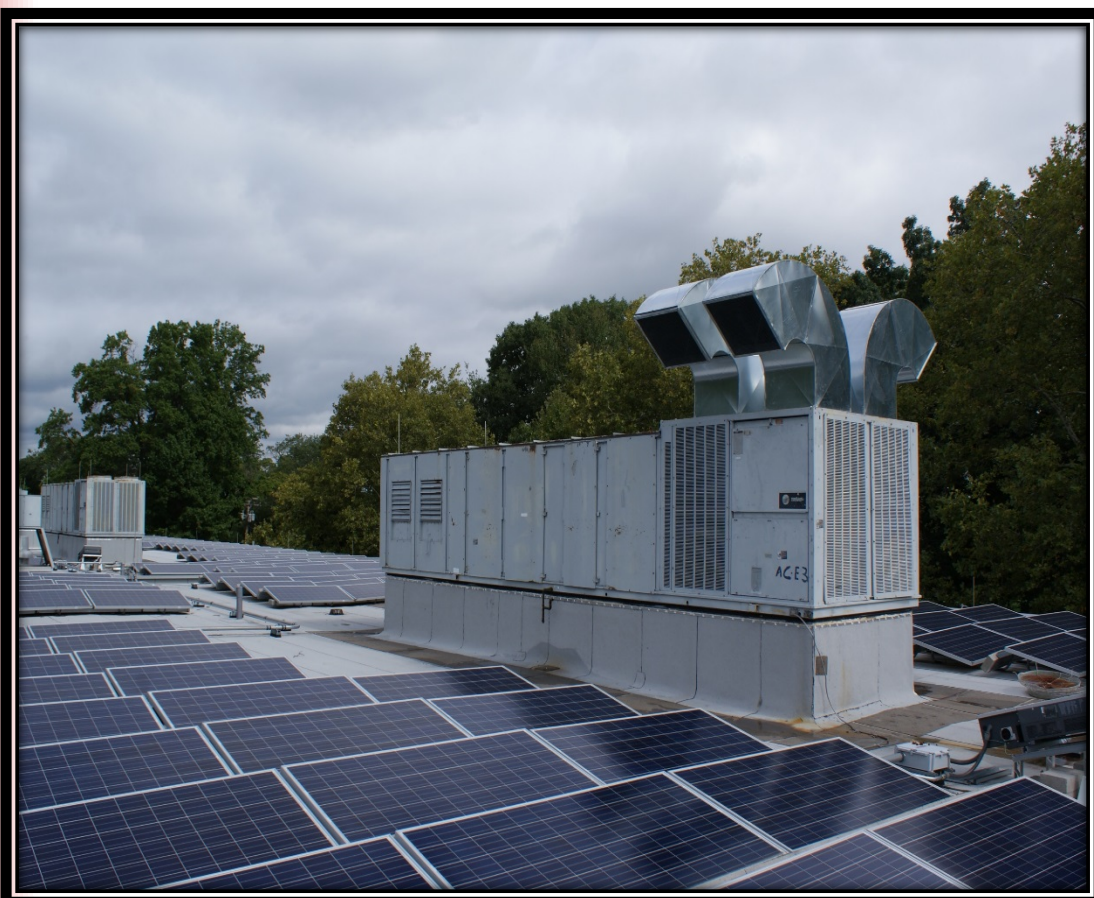
Fairfield Warde High School Fitts House HVAC RTU Replacement