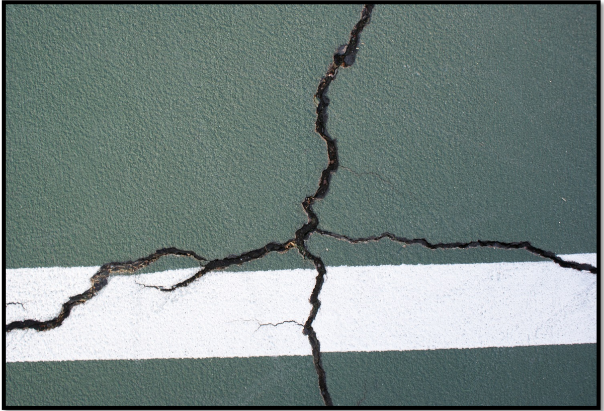
Existing Tennis Court Conditions