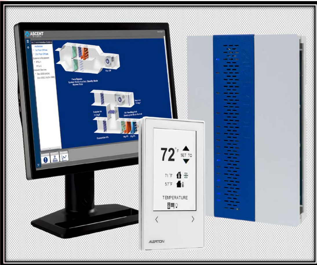
Districtwide I.T. Server Network Isolated Communication HVAC Controls