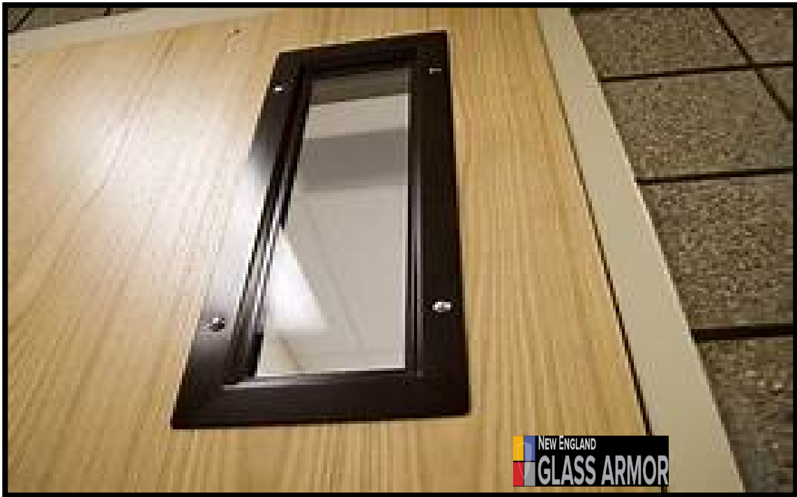
New Security Intrusion Panel Interior Classroom Door