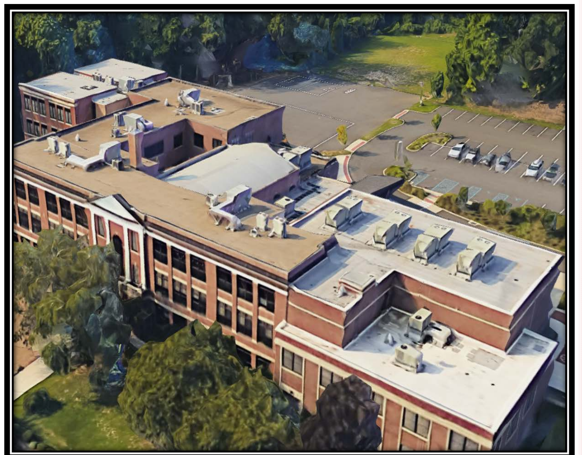
Stratfield Elementary School Roof Replacement