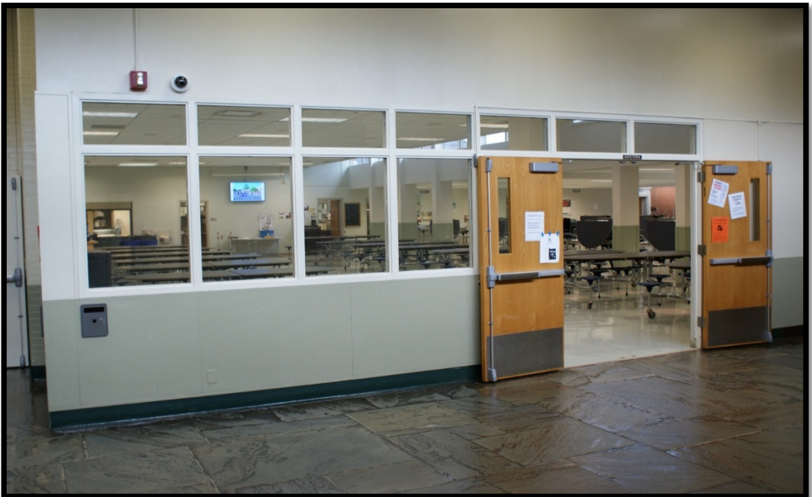
Existing Interior Large Places of Assembly Windows