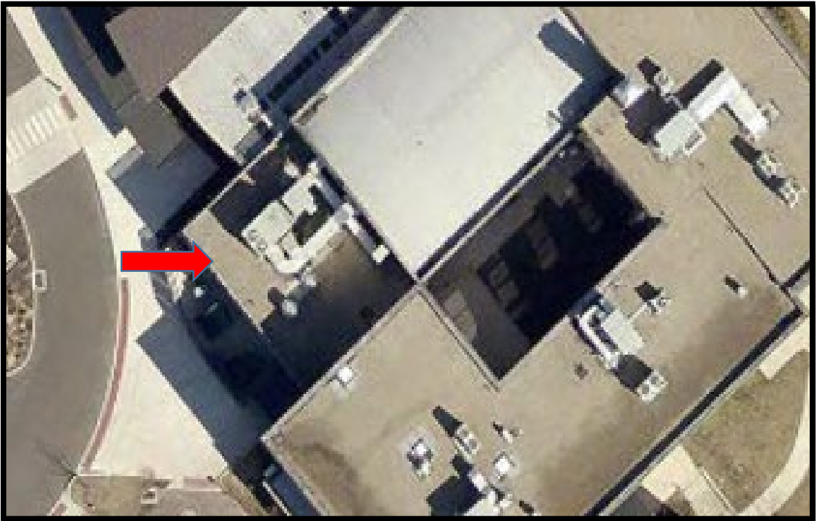
Existing Roof Conditions