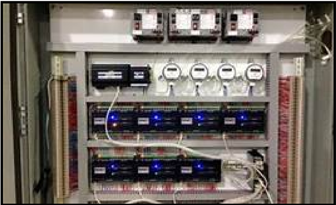
New “State of the Art” HVAC Control System