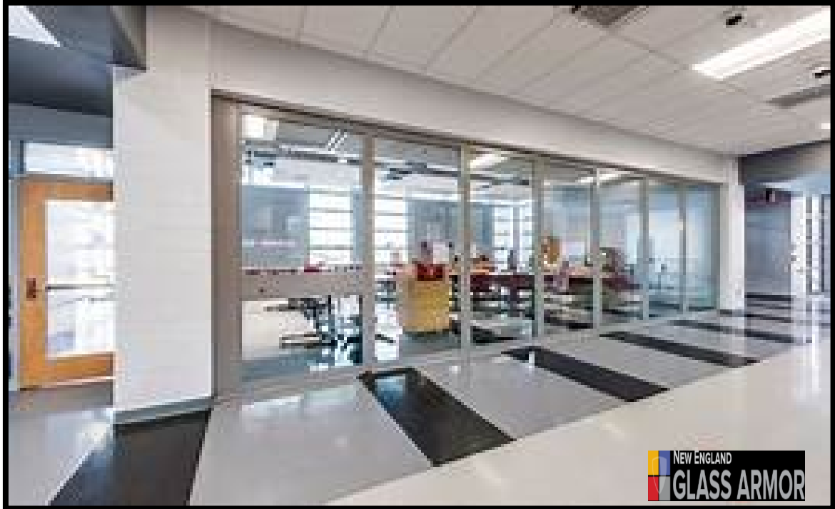
New Security Intrusion Panel Interior Large Places of Assembly Windows