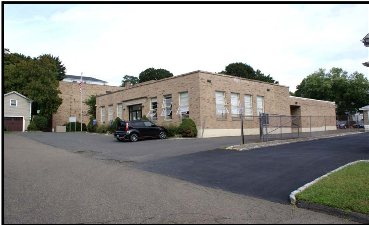
Existing Walter Fitzgerald Campus (108 Biro Street)