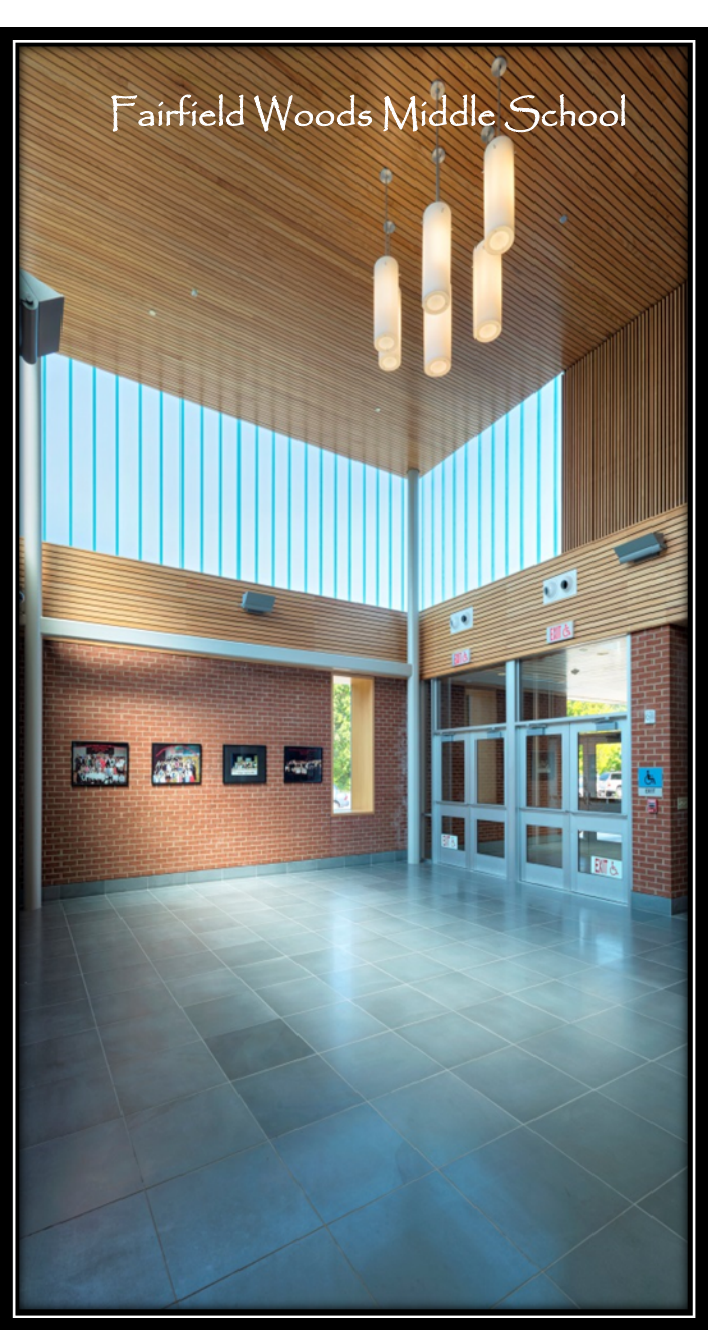
Draft September 9, 2014