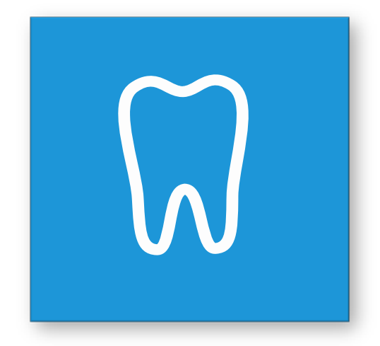
Find a dental office, 24 hours a day, 7 days a week