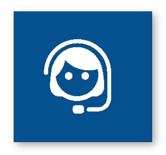
Talk to a live customer service representative 24/7/365